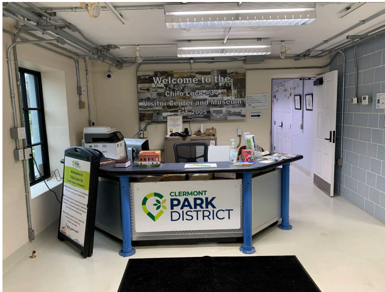
First floor information desk

Below are photos of the interior of the visitor center and museum