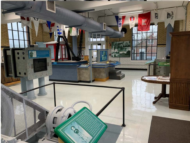
Second floor display space