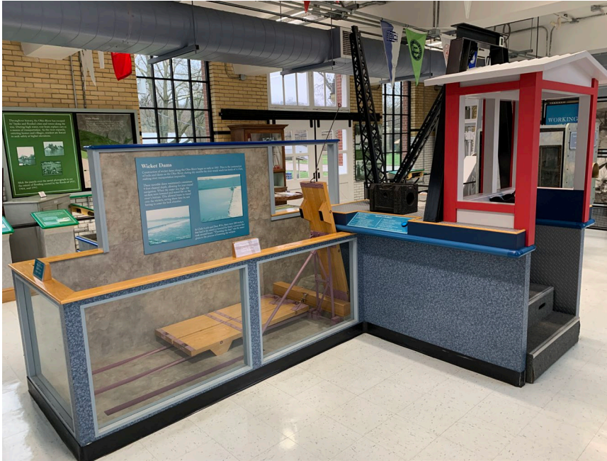
Second Floor wicket display