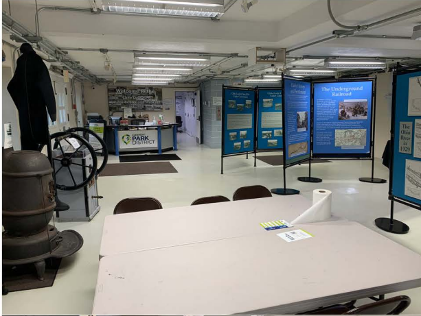
First Floor exhibit space