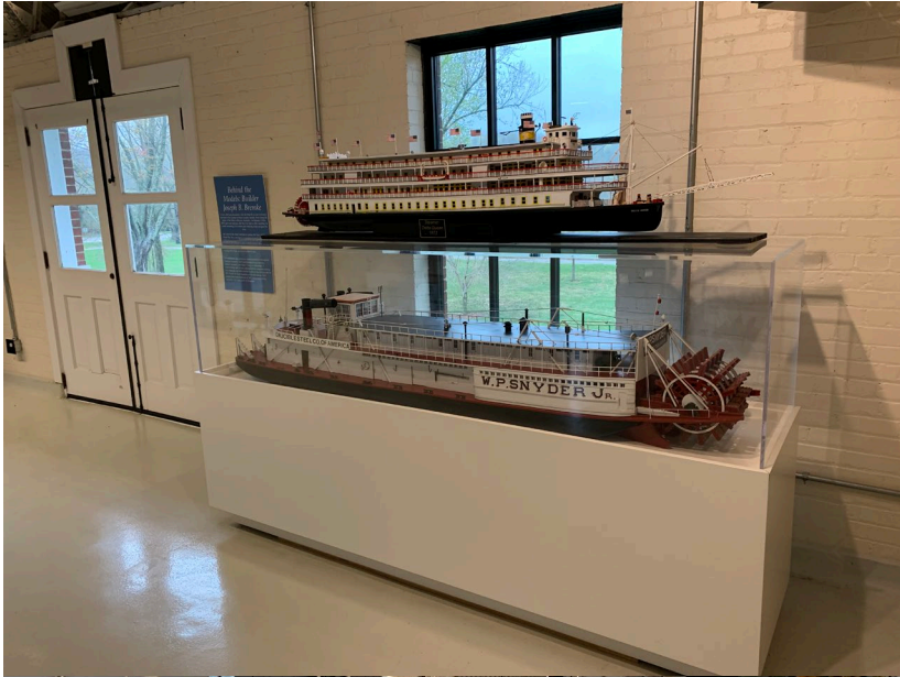
Third Floor model display