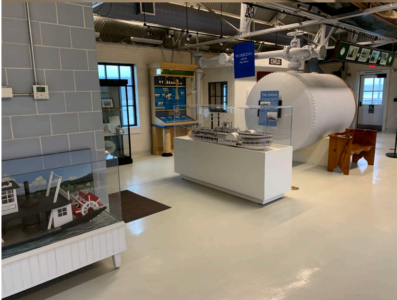
Third Floor display space