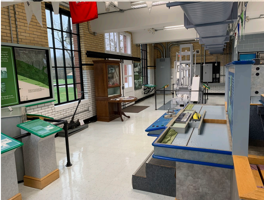
Second Floor lock display